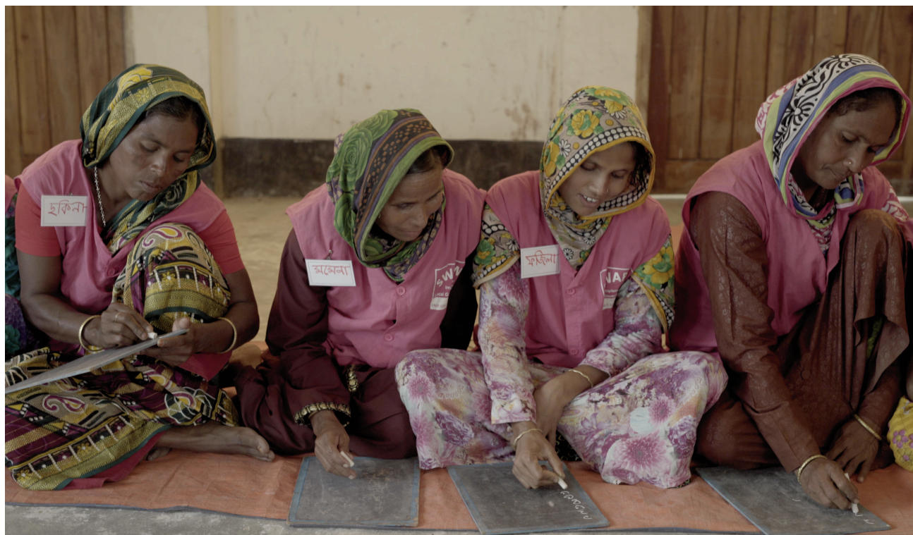
Women participating in a livelihood skills training as part of an SDG Fund joint program in Bangladesh.

This program underscores the positive connections between women’s inclusion, poverty reduction, and peaceful societies. It also highlights the power of SMEs to promote inclusive growth. By facilitating public-private partnerships with these enterprises (SDG 17), it is generating job opportunities that empower women, build the resilience of households, and increase economic inclusion (SDGs 5 and 8), which ultimately makes the community more inclusive and peaceful (SDG 16).