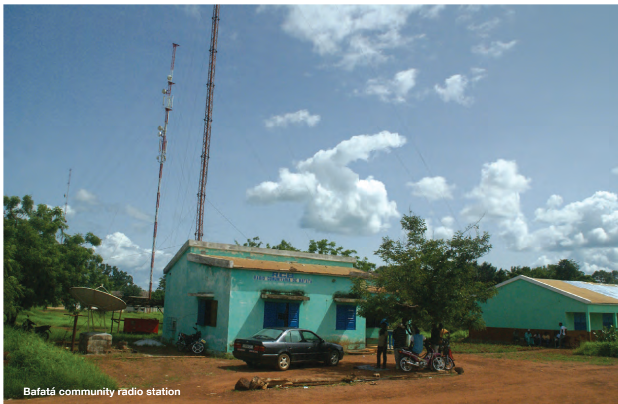
Bafatá community radio station

politicians at the topmost level to come to the Cacheu region to find a solution. 12