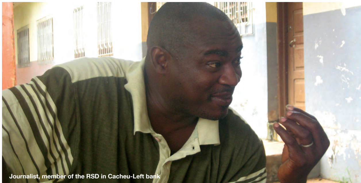
Journalist, member of the RSD in Cacheu-Left bank