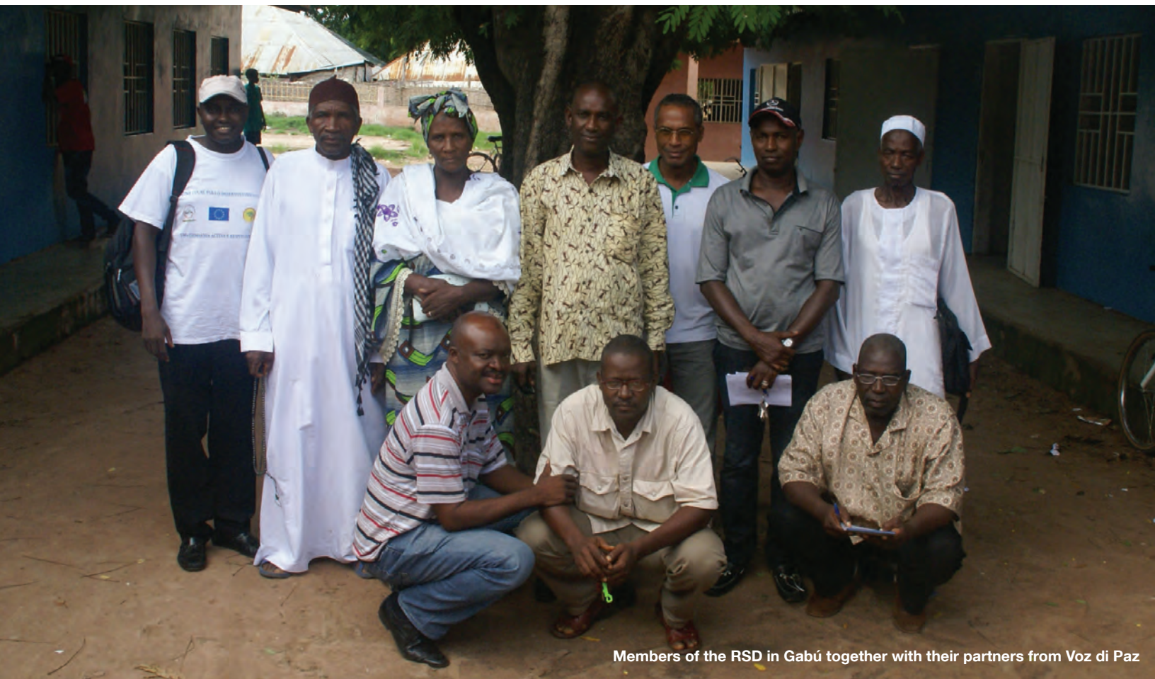
Members of the RSD in Gabú together with their partners from Voz di Paz