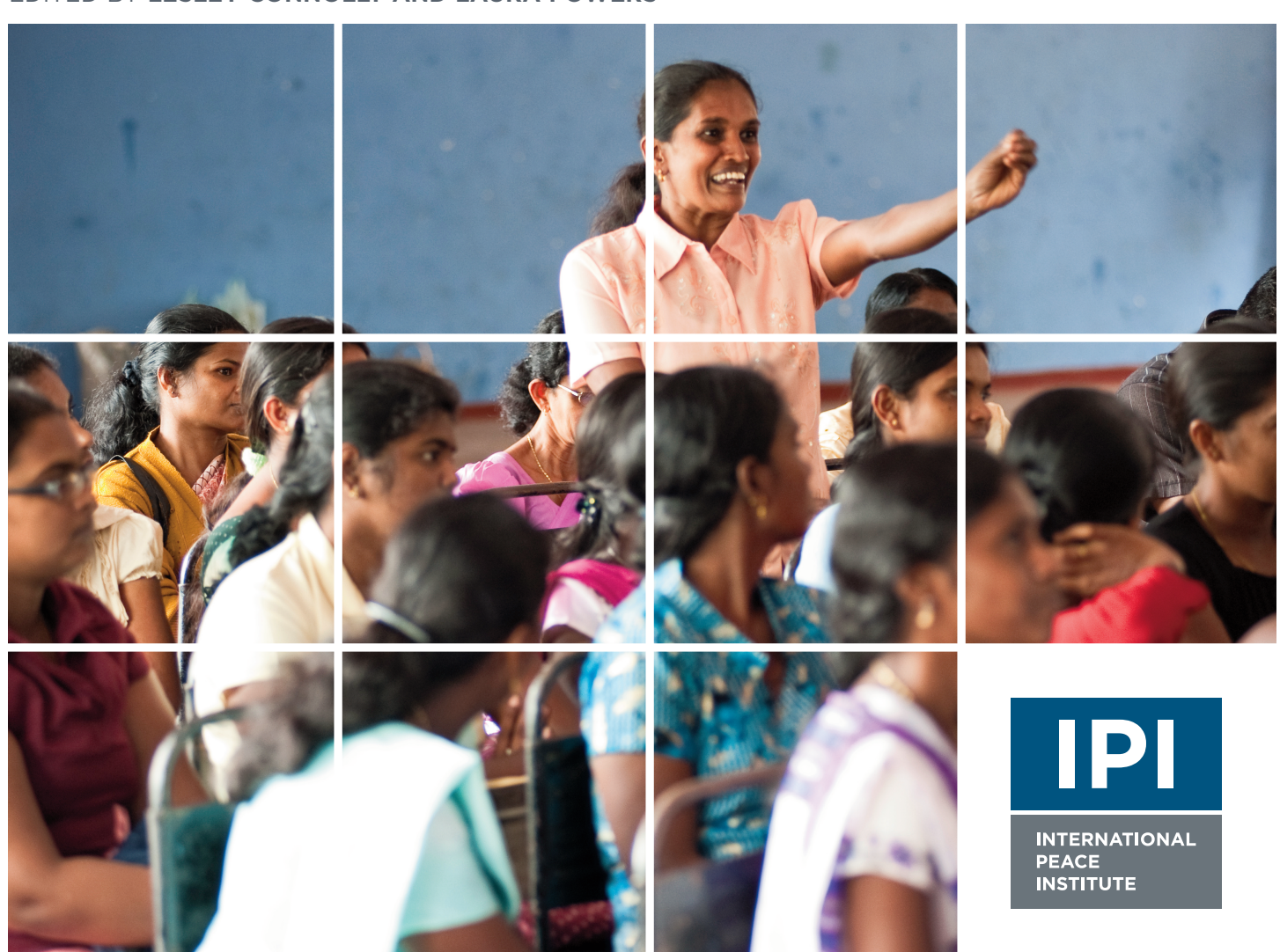
EDITED BY LESLEY CONNOLLY AND LAURA POWERS