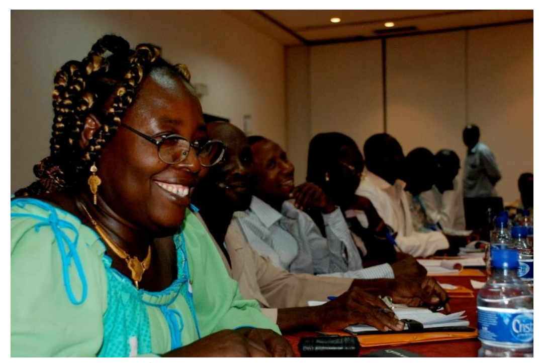
Mediation workshop in N'Djamena, Chad.

resolution, including by facilitating dialogue at the national and local levels. In this challenging context, the PDA supported efforts led by the Resident Coordinator to recruit and train mediators from a cross-section of society, empowering them to support the resolution of a range of community conflicts. In partnership with the national NGO Peace and Reconciliation Committee and the Media House N'Djamena, the PDA supported the design and coordination of a successful initiative that brought together a range of partners engaged in dialogue and mediation work throughout Chad including government; civil society; religious leaders; youth leaders; women's peacebuilding NGOs; traditional leaders; human rights activities; and the media. The variety of actors combined to form a 'Peace Caravan' which travelled to a number of areas across the country. Following the training of mediators, the Peace Caravan with support from UNDP and the Swiss Federal Ministry of Foreign Affairs was carried out by CSAPR with participation of the mediators and representatives of the political majority and the opposition. The caravans