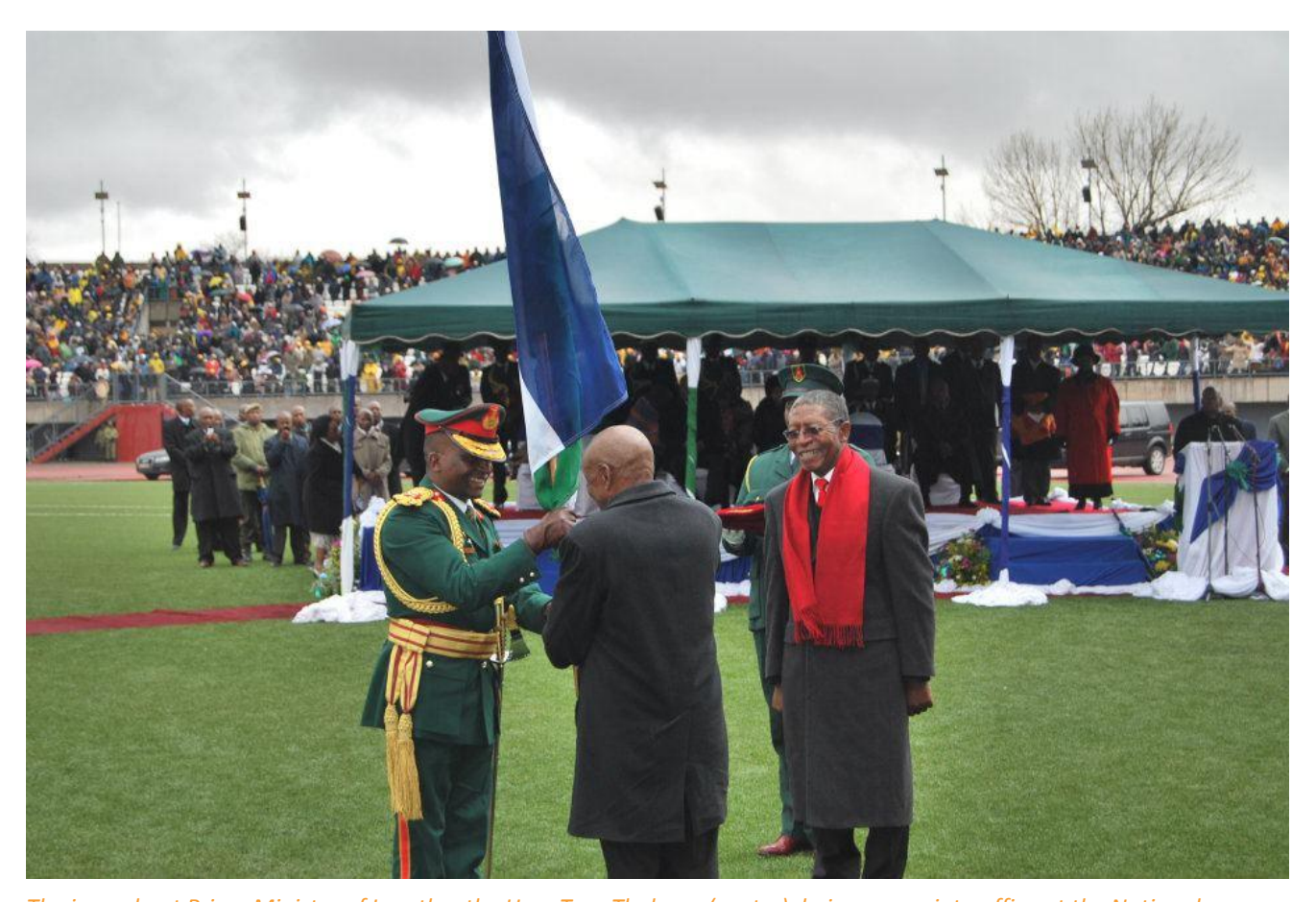
The incumbent Prime Minister of Lesotho, the Hon. Tom Thabane (center), being sworn into office at the National Stadium as the out-going Prime Minister Mosisili looks on.

The report aims to highlight the variety of contexts in which the Joint Programme provides support, with notable results achieved in countries as diverse as Ghana to FYRO Macedonia, from Fiji to Lesotho. Ultimately, the report aims to increase awareness of the Joint Programme's work and emphasize the value of support in positioning the UN to help nations address, manage, and resolve the challenges presented in complex political situations.