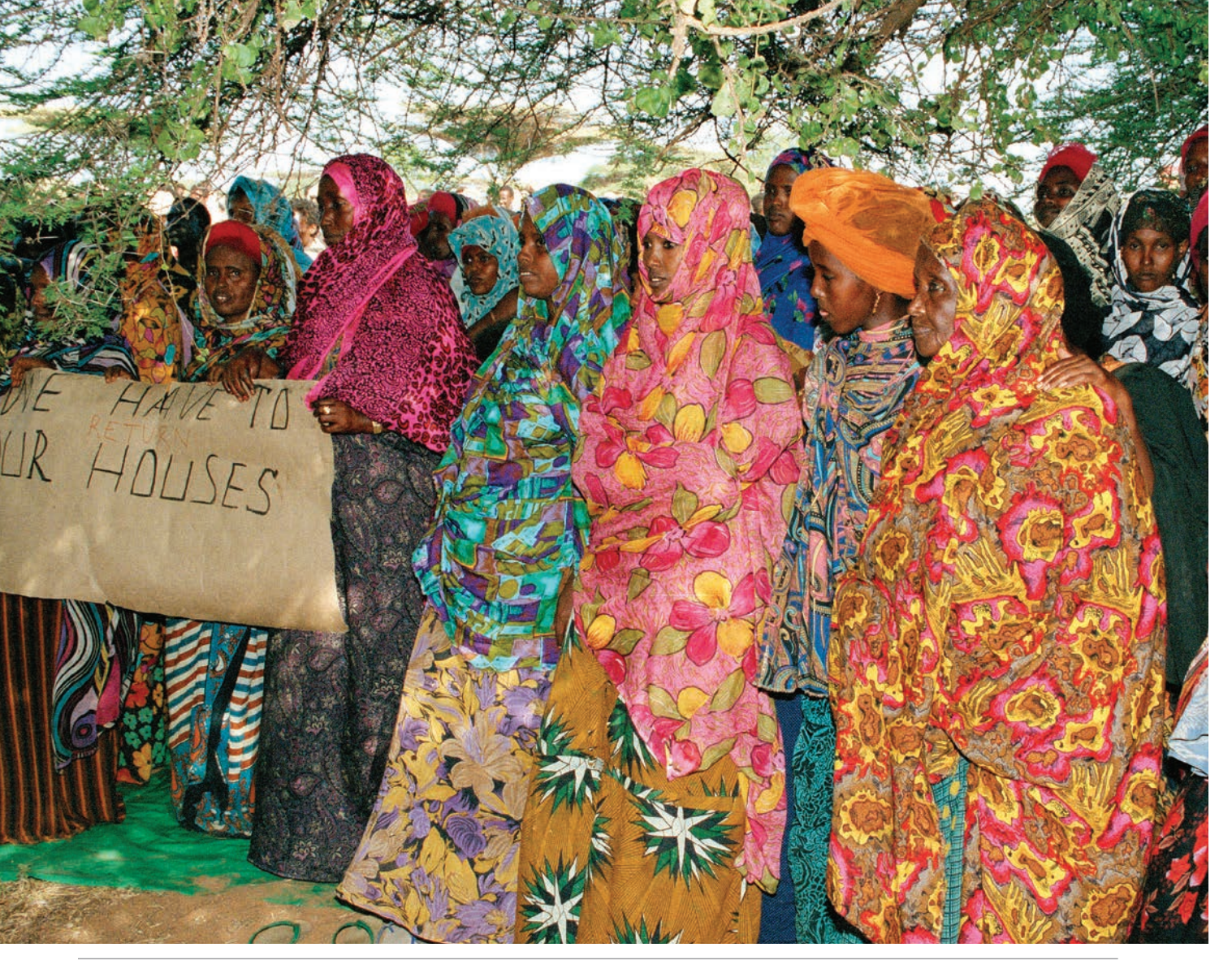
United Nations Operation in Somalia (UNOSOM): Somali women, including elders of the community, assembled for a meeting with Admiral Jonathan T. Howe, Special Representative of the Secretary-General for Somalia.

These results are a matter for concern, taking into account that women's participation in peace talks is one of the cornerstones of resolution 1325 (2000), and that women's civil society groups have used this to increase their demands to participate in peace agreements and inject them with language that addresses gender issues.