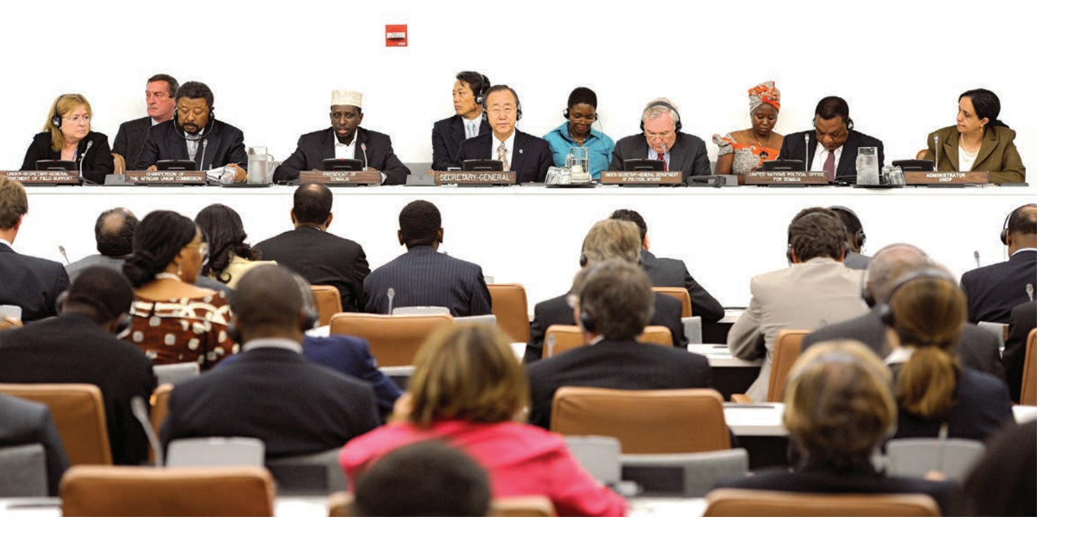
The President of the Somali Republic addresses a high-level meeting on the peace process in his country, held on the sidelines of the sixty-fifth General Assembly.

Given that there are so few peace agreements that include any reference to gender—let alone treat gender-related issues comprehensively in the provisions of the accord—it is difficult to assert with confidence the specific conditions under which women's participation in peace agreements can result in better outcomes for the sustainability of peace or for the representation of women's interests.