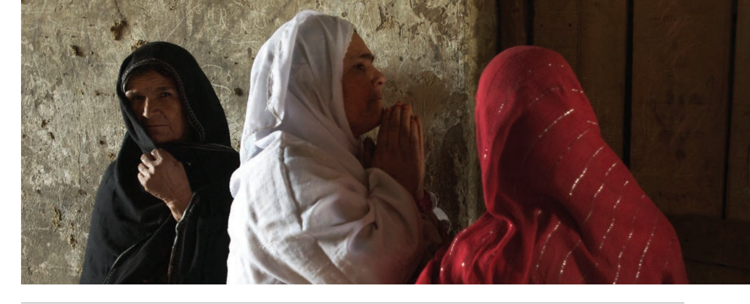
Women gather in the corridor of their home in Bagram, Afghanistan.