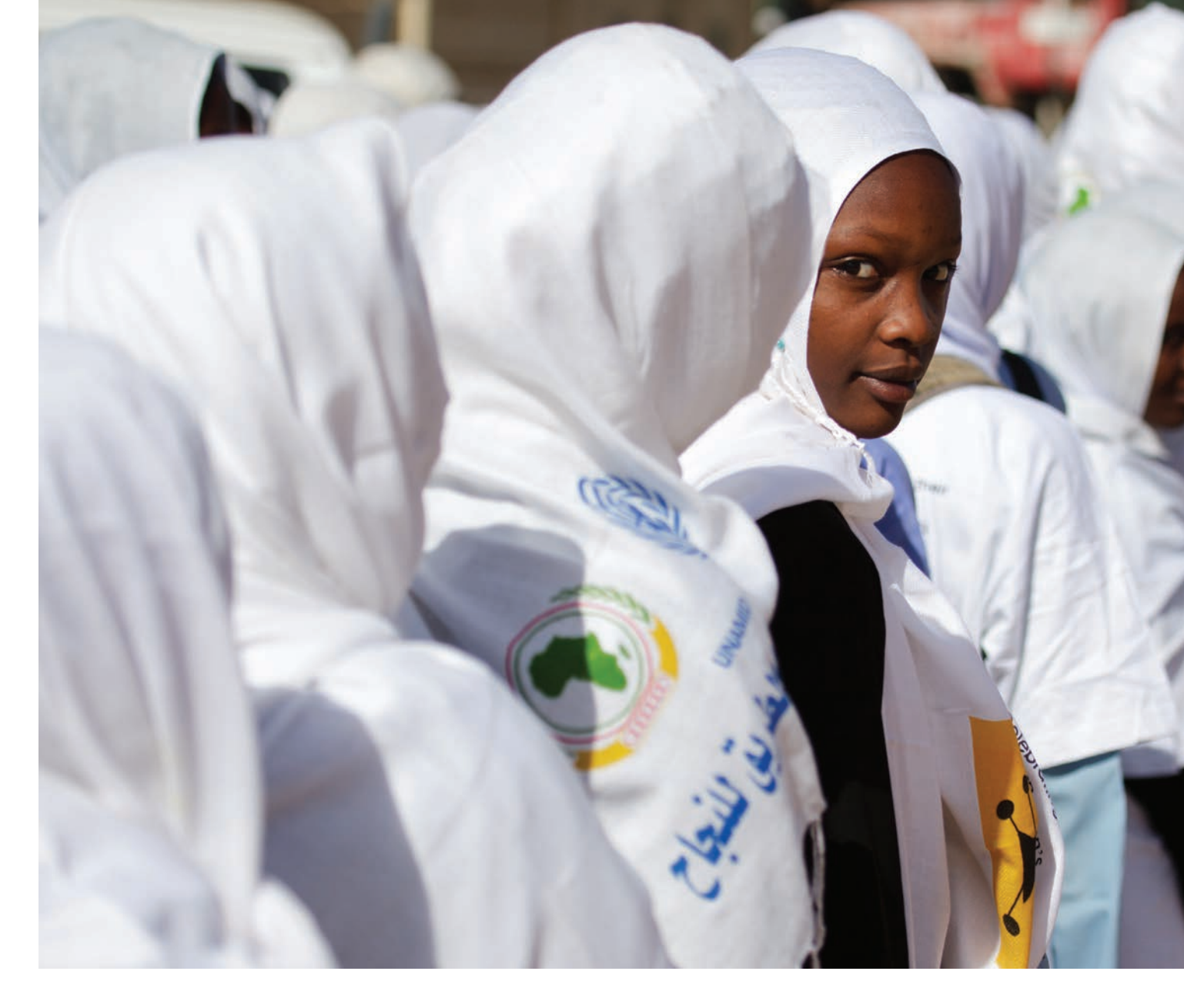
Sudanese women and girls march in El Fasher, North Darfur, to celebrate International Women's Day, in many places the day's 100th anniversary. The theme this year: "Equal Access to Education, Training, Science and Technology".

not receive the attention that ceasefires or comprehensive peace agreements do, especially important, as well as expertise in transitions and state-building with a gender perspective.